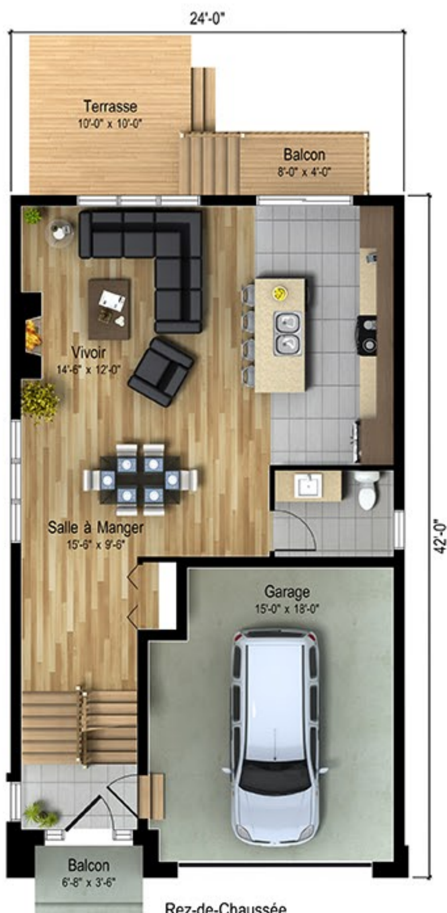
Rez-de-Chaussée Sup. Habitable: 690 pi 2 Sup. Garage: 302 pi 2 Sup. Totale: 1678 pi 2